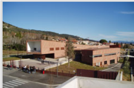
View of the Lycée Iscles in Manosque

On the initiative of the PACA regional council, the Steering Group of the ITER International School has decided to open the International School in Manosque on the premises of the Lycée Les Iscles in September 2007. A new building for the International School will be constructed in 2009 very near the Lycée Les Iscles, so that the families will be able to familiarise themselves with their future environment.