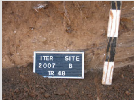
Sign and measurement stick in one of the exploratory ditches made for the archeological survey. Click on the picture for high-res.