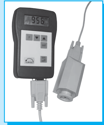
PIZA vacuum gauge.

We deliver two types of battery operated pre-vacuum gauges. This type of gauge is very useful at times, when you like to measure a pre-vacuum pressure at a place, where no 230V power is available. Both gauges have a Piezo-sensor (Atmosphere to 1 mbar). One of these units also has an integrated Pirani-gauge to measure pressures from Atmosphere to 1 \cdot 10^{-3} mbar.