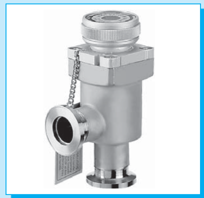
Manual operated SMC valve with position indicator.